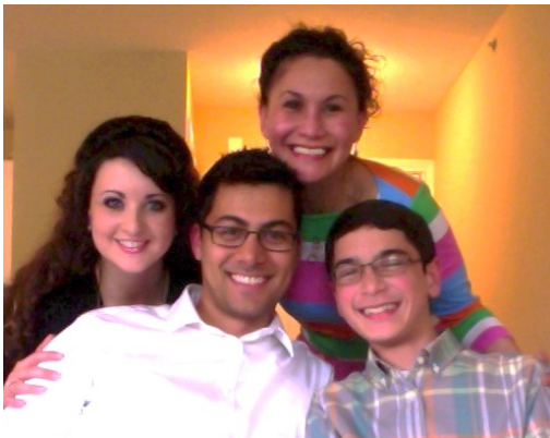
Mothers Day (May 2014)